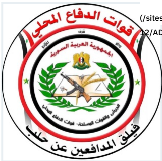
Aleppo Defenders Legion logo