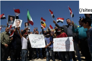
Figure 1: Aleppo Defenders Legion members holding signs reading "Death to America and Israel."