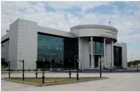
BRIEF ANALYSIS Making Sense of Iraq's Politicized Supreme Court Rulings