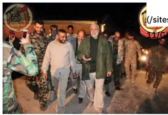
Figure 1: Haider al-Gharawi and Abu Mahdi al-Muhandis, date unknown.