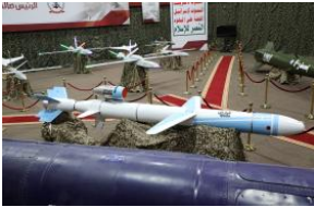
ARTICLES & TESTIMONY Iran-Backed Attacks on Ships in the Red Sea Underscore a U.S. Dilemma

Dec 4, 2023 ♦ Selin Uysal (/policy-analysis/making-sense-iraqs-politicized-supreme-court-rulings)