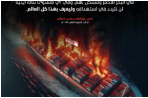
BRIEF ANALYSIS Containing the Houthis in Yemen: Issues and Options for the Policy Review