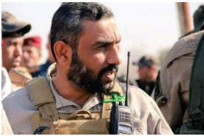
Profile: Ansar Allah al-Awfiya (19th PMF Brigade) (/policy-analysis/profile-ansar-allah-al-awfiya-19th-pmf-brigade)