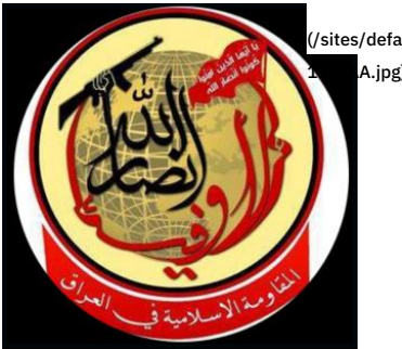
Ansar Allah al-Awfiya logo