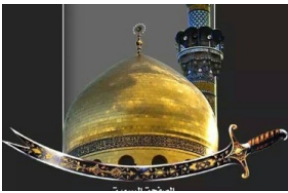
Profile: Liwa Abu Fadl al-Abbas (/policy-analysis/profile-liwa-abu-fadl-al-abbas)