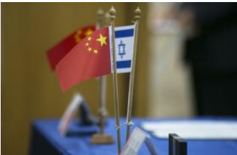
Tracking Chinese Statements on the Hamas-Israel Conflict (/policy-analysis/tracking-chinese-statements-hamas-israel-conflict)