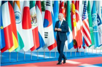
BRIEF ANALYSIS Coordinated Iran Sanctions Require Coordinated Enforcement