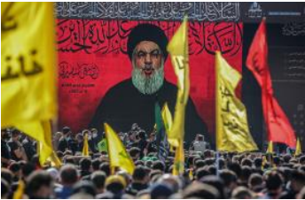
What Did Nasrallah Really Say, and Why? (/policy-analysis/what-did-nasrallah-really-say-and-why)